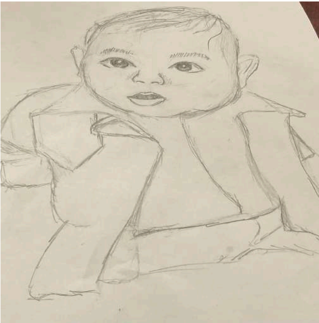
Tibin : Gr 6