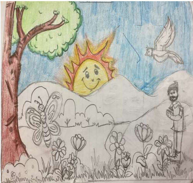
Saket : Gr 5