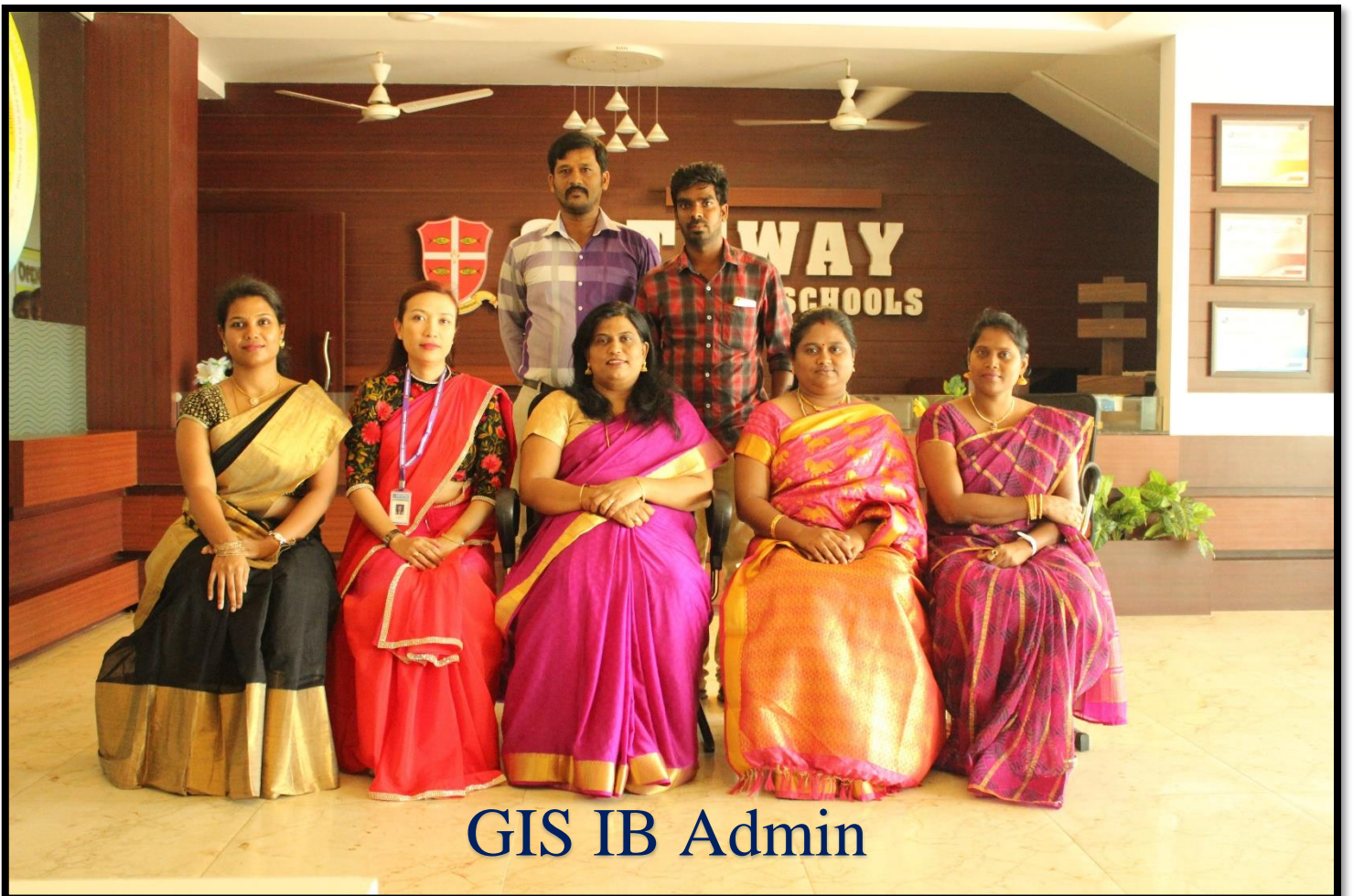
GIS IB Admin