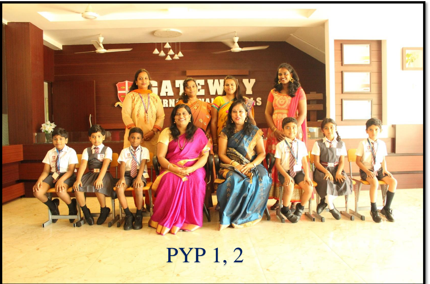
PYP 1, 2