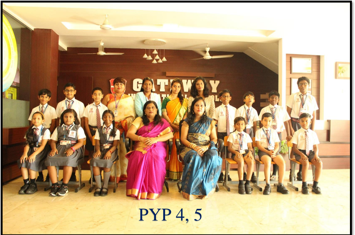
PYP 4, 5