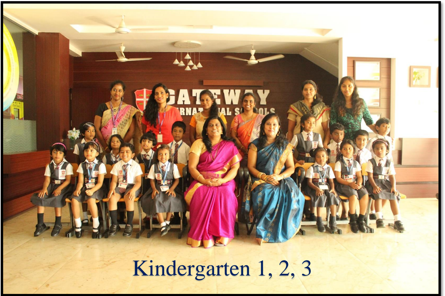
Kindergarten 1, 2, 3