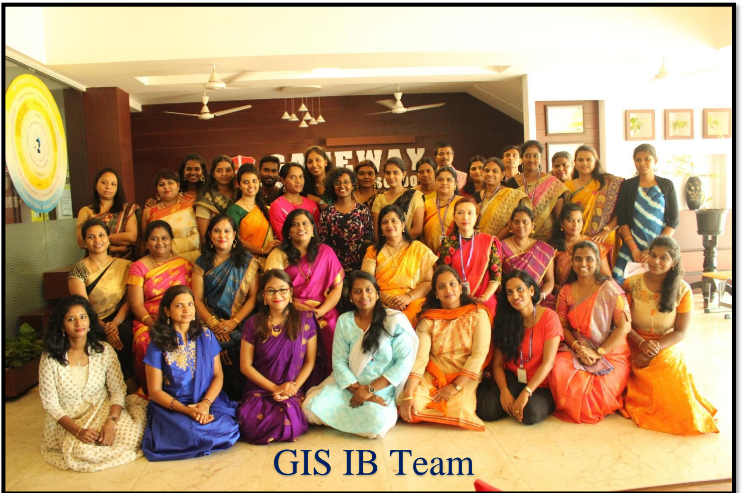
GIS IB Team